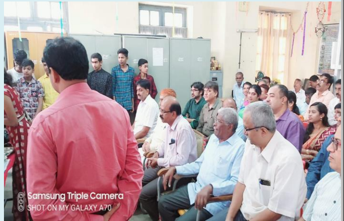
Samsung Triple Camera SHOT ON MY GALAXY A70