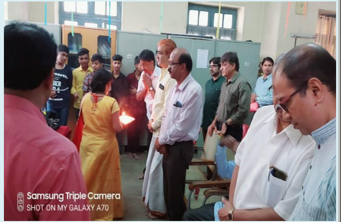
Samsung Triple Camera SHOT ON MY GALAXY A70