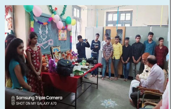
Samsung Triple Camera SHOT ON MY GALAXY A70