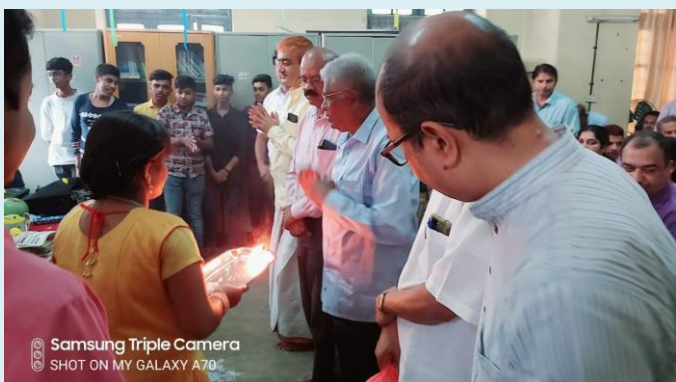
Samsung Triple Camera SHOT ON MY GALAXY A70