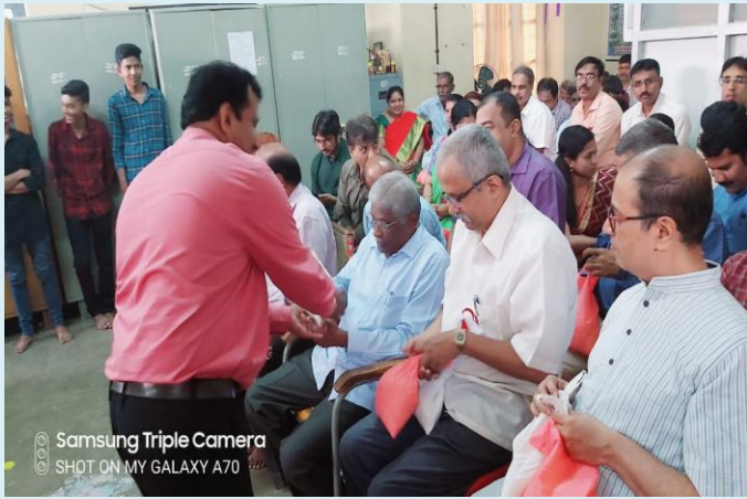
Samsung Triple Camera SHOT ON MY GALAXY A70