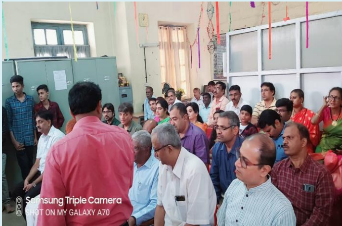
Samsung Triple Camera SHOT ON MY GALAXY A70