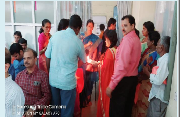
Samsung Triple Camera SHOT ON MY GALAXY A70