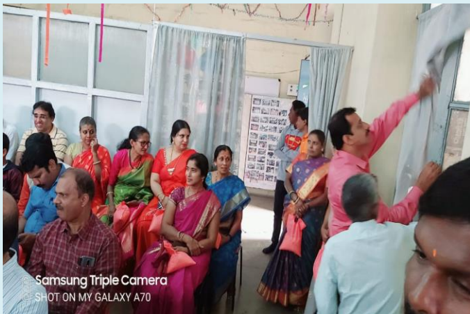
Samsung Triple Camera SHOT ON MY GALAXY A70