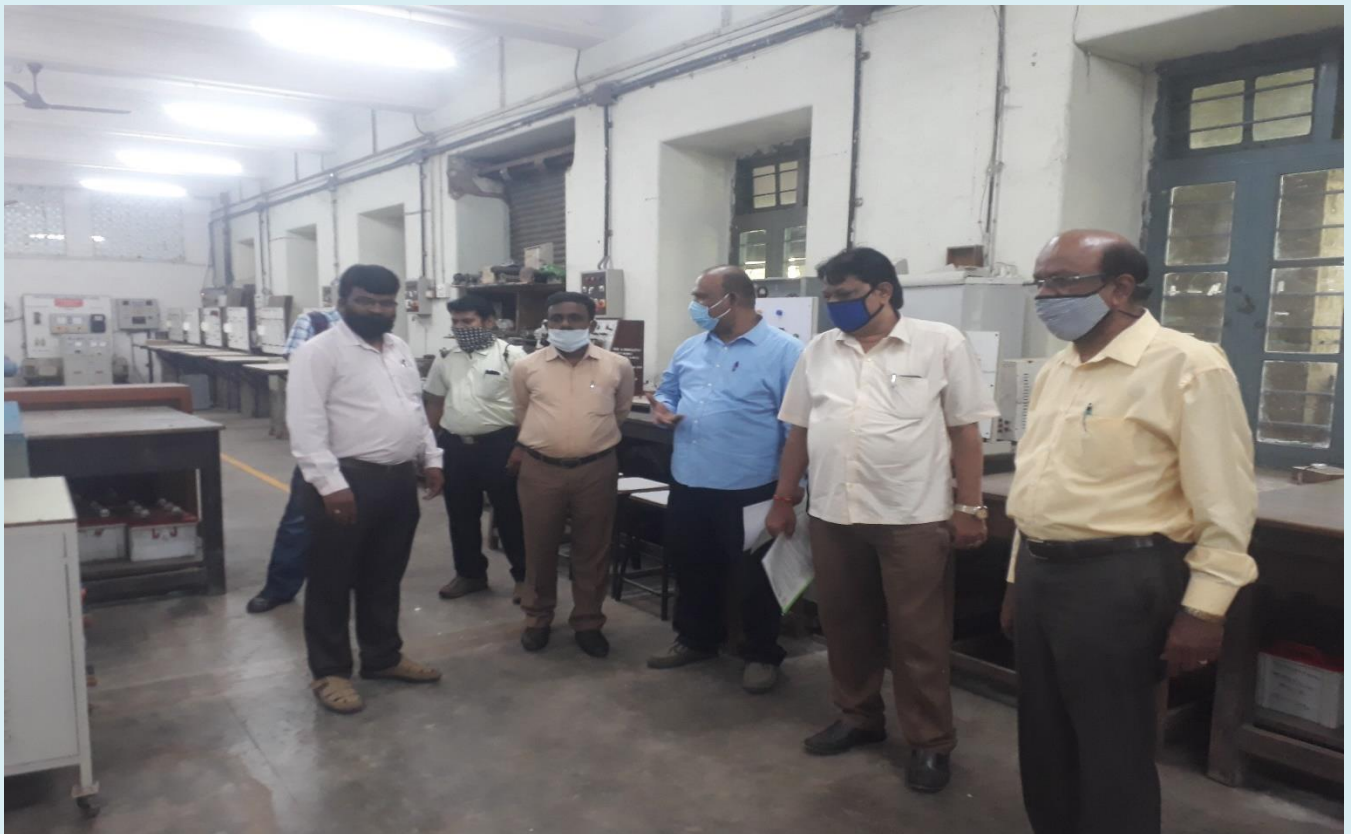
VISIT TO ELECTRICAL DEPARTMENT LABORATORIES