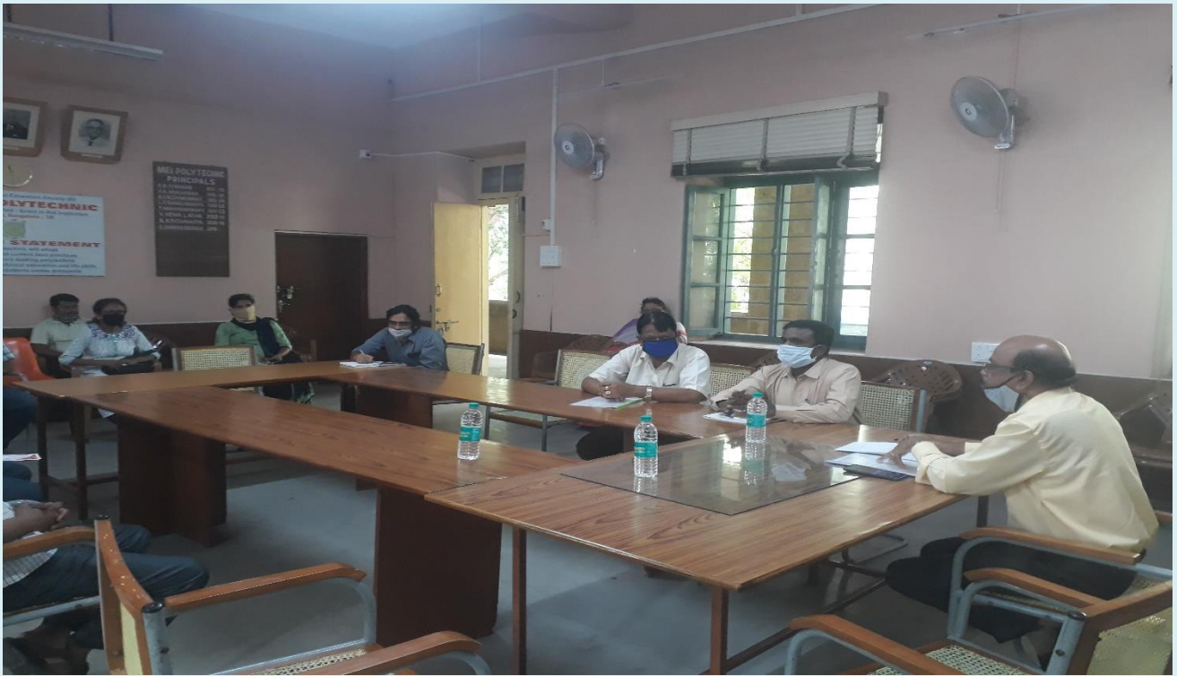
TEAM INTERACTING WITH STAFF MEMBERS