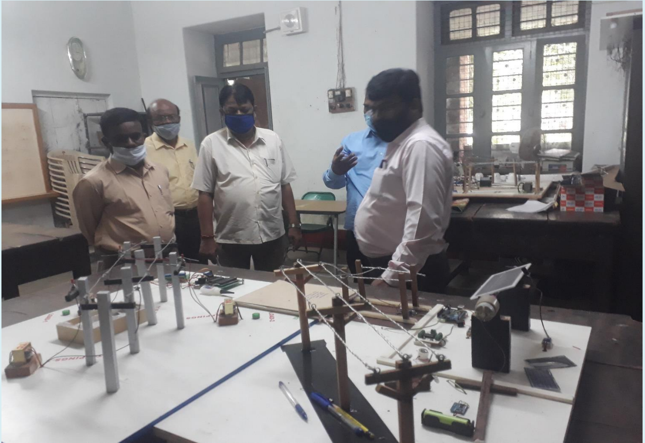
VISIT TO ELECTRICAL DEPARTMENT LABORATORIES