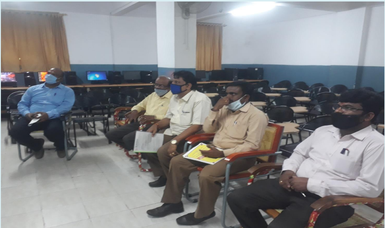
VISIT TO DIGITAL LIBRARY