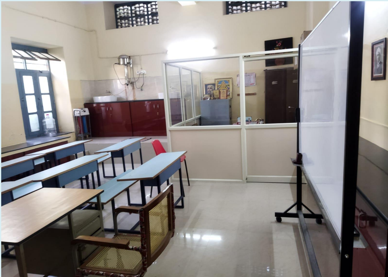
ENVIRONMENTAL ENGINEERING LABORATORY