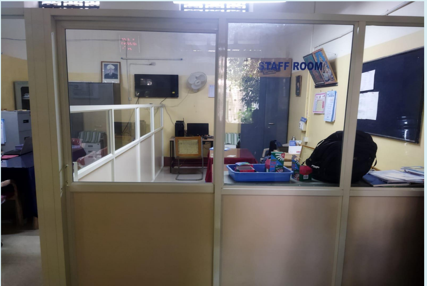
CIVIL DEPARTMENT STAFF ROOM