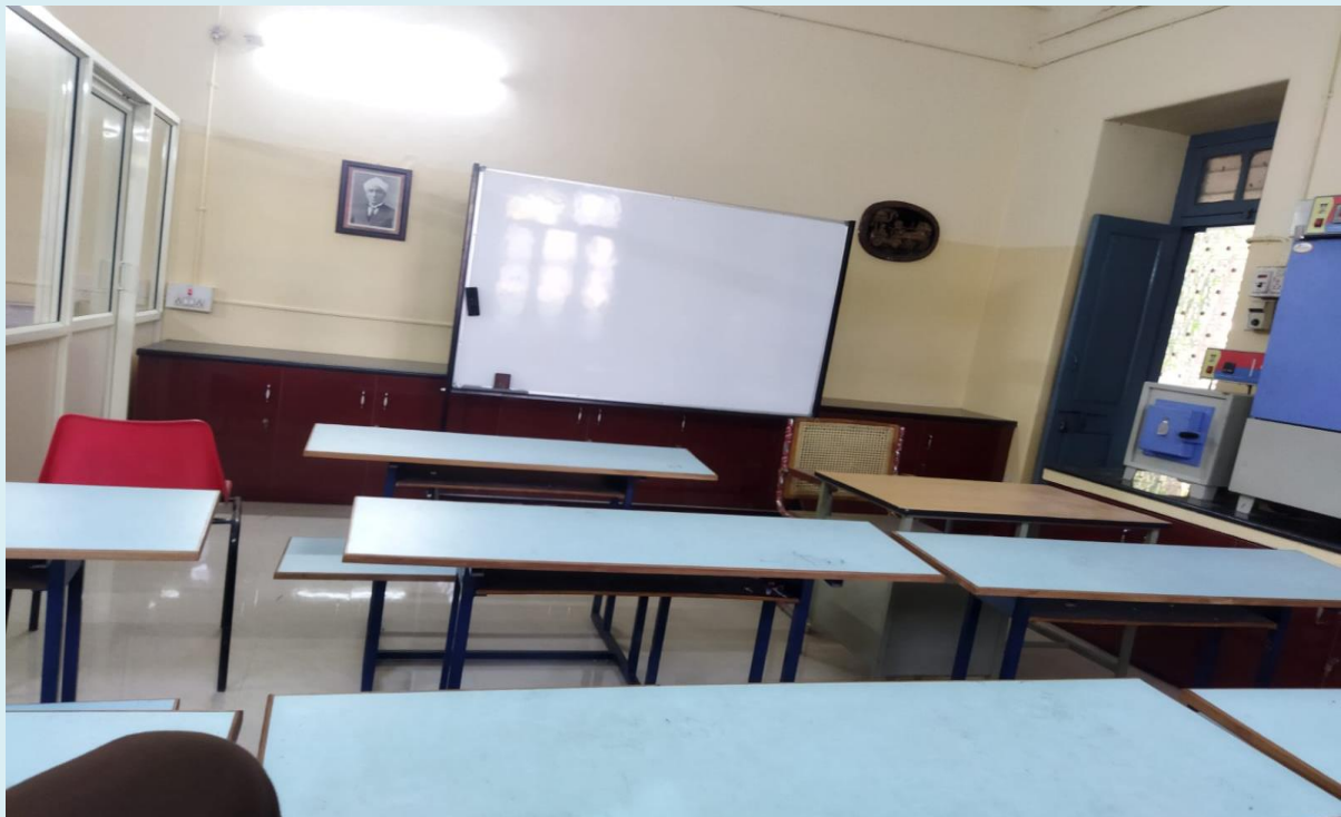
MODERN SURVEY PRACTICE INSTRUCTION ROOM