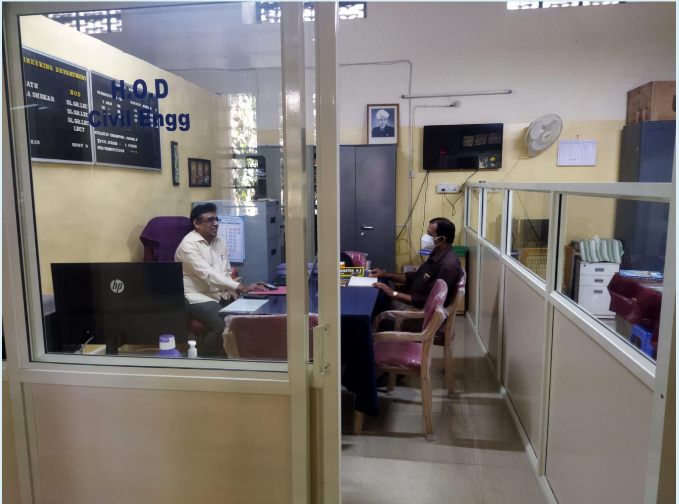
Head of the Department, Civil Engineering Chamber

Renovation of Civil engineering laboratories and staff rooms were undertaken during the month of April 2020 to September 2020.