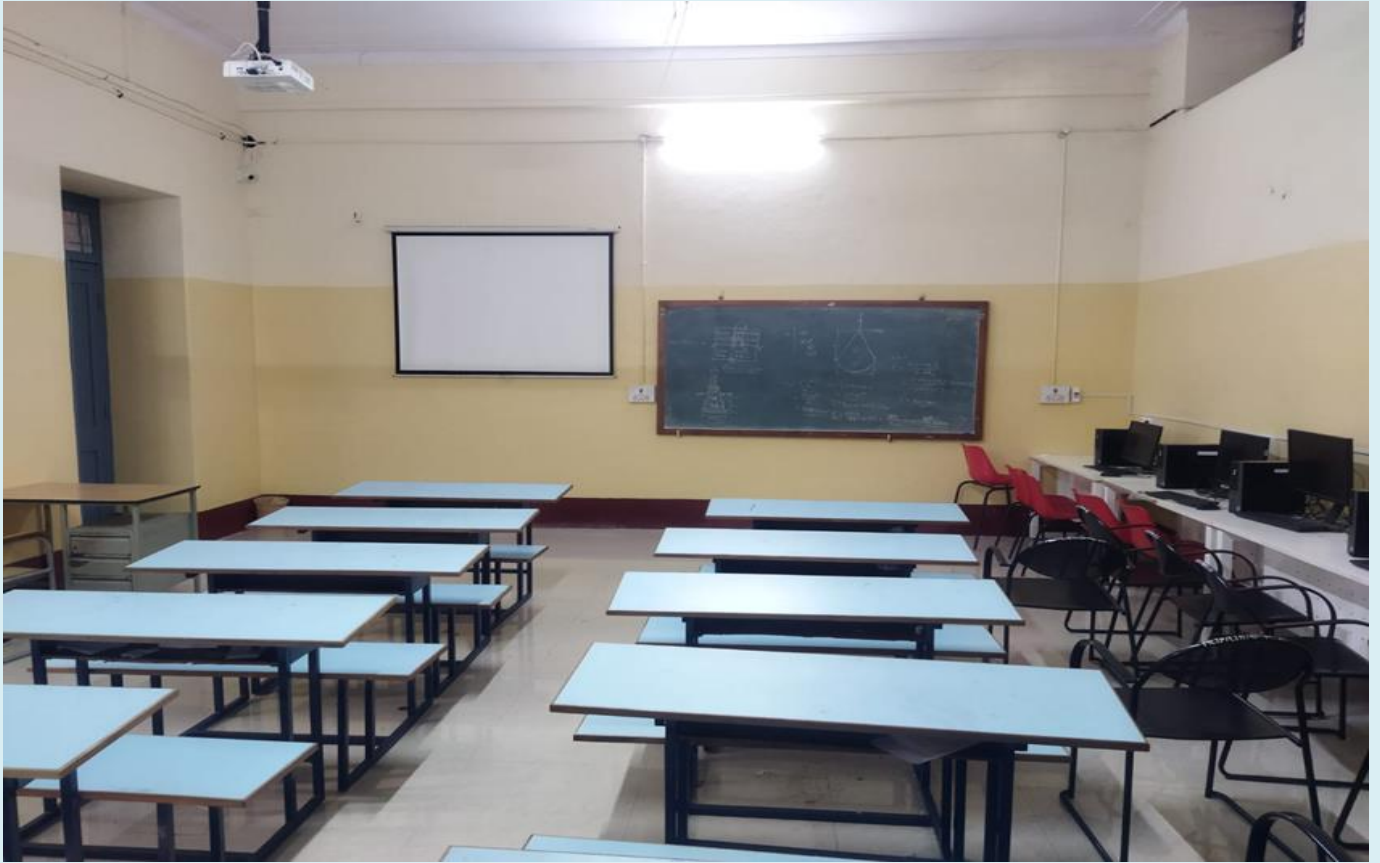
CIVIL DEPARTMENT E CLASS ROOM