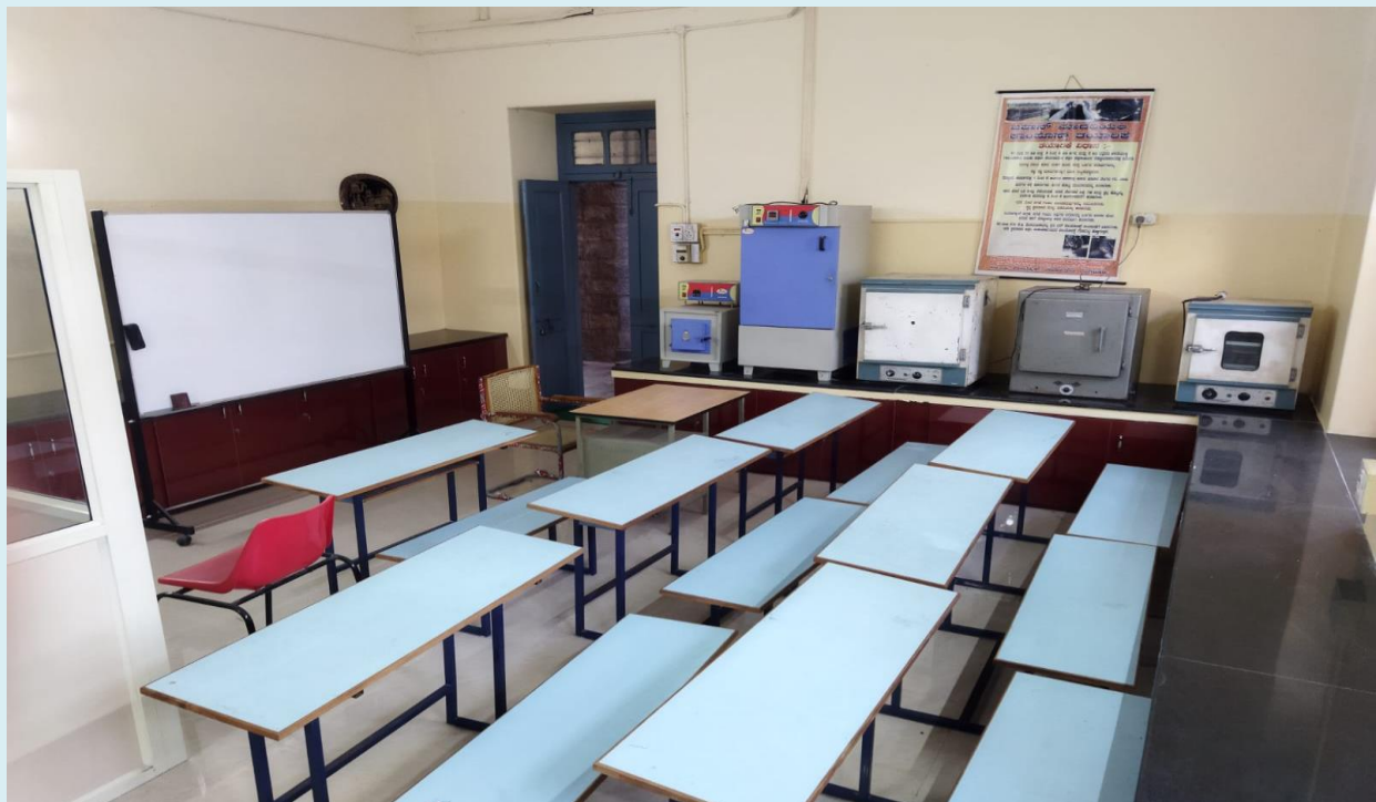
ENVIRONMENTAL ENGINEERING LABORATORY