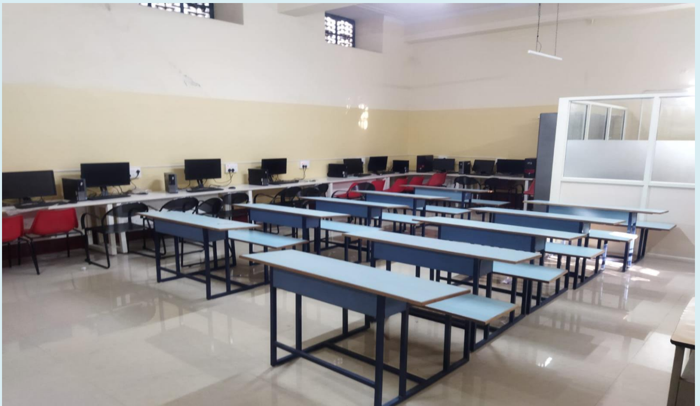
CAD LAB FOR ENGINEERING MECHANICS AND STRENGTH OF MATERIALS